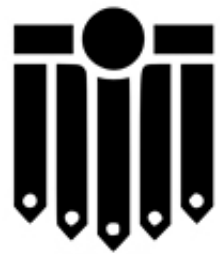
BELT OF TRUTH