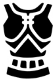
BREAST PLATE OF RIGHTEOUSNESS