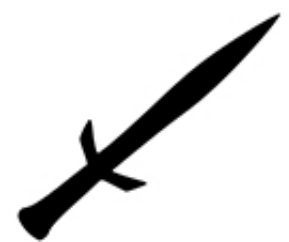
SWORD OF SPIRIT