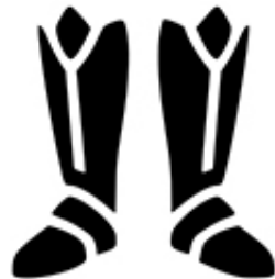
SHOES OF PEACE